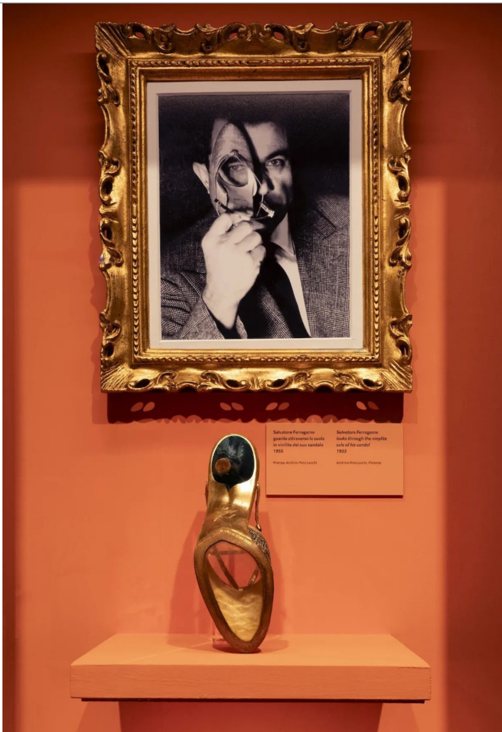
Salvatore Ferragamo guarda attraverso la suola in vinilite del suo sandalo 1955 Firenze, Archivio Pitti Louche Salvatore Ferragamo looks through the vinylite sole of his sandal 1955 Archivio Pitti Louche, Firenze